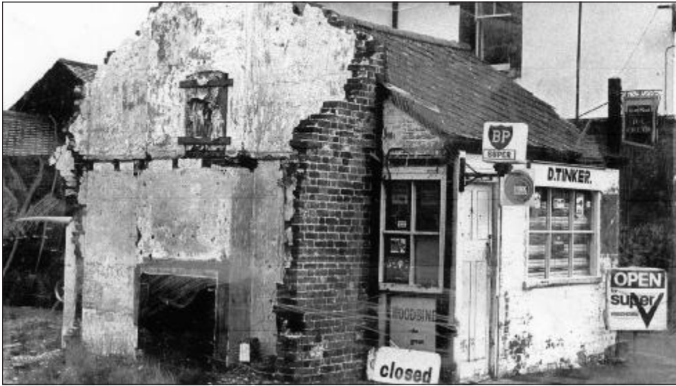
Closed shop: What remained of the old Torworth village shop complete with petrol pump after the cottage was demolished