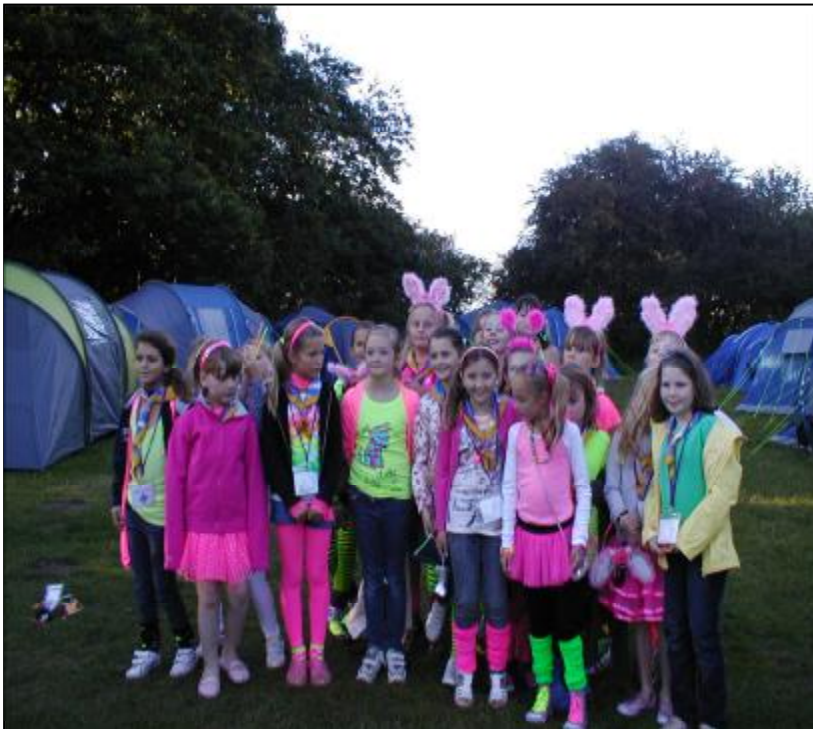
Ranskill Brownies "Neon Night" at camp.