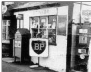
Sign of the times: The heyday of the shop

(it saved travelling to Retford or Doncaster) but gone was the petrol pump.